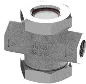
1/2" - 1"