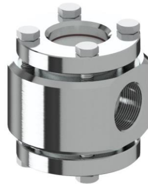
1 1/4" - 2"