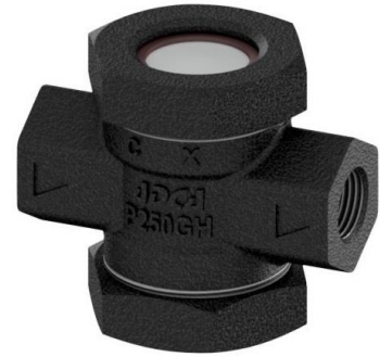
1/2" - 1"

INSTALLATION: Horizontal or vertical installation. See IMI – Installation and maintenance instructions.