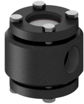
1 1/4" - 2"