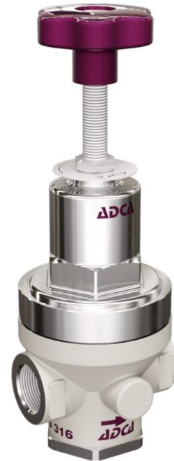
PS31SS 1/2" – DN 15

ORDER REQUIREMENTS: Type of fluid. Maximum operating temperature. Required opening pressure capacity (maximum and minimum).